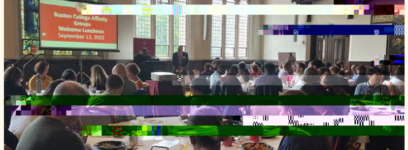
The 2022 Affinity Groups Welcome Luncheon